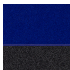
004 Ultramarine/Gray Melange