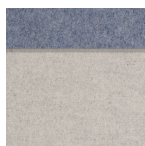
002 Quartz Melange/Chestnut