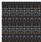
004 Sepia and Silver