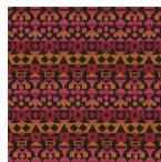
003 Crimson and Pink