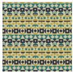
007 Marine and Turquoise