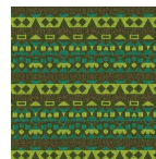
006 Green and Gold