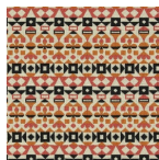
002 Pink and Orange