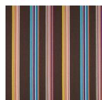
001 Rhythmic Stripe

Complete product information at maharam.com 800.645.3943