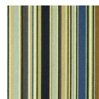
006 Echoed Stripe