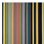
004 Reverberating Stripe