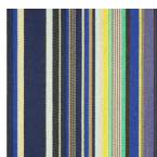
008 Staccato Stripe