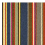
009 Rhapsodic Stripe