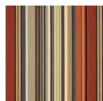
007 Harmonious Stripe