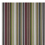
002 Modulating Stripe