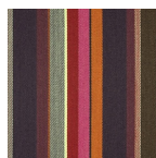
010 Melodic Stripe