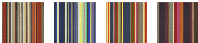
007 Harmonious Stripe 008 Staccato Stripe 009 Rhapsodic Stripe 010 Melodic Stripe