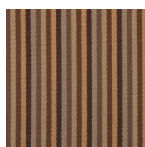
001 Multicolored Bright 002 Multicolored Neutral