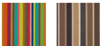
001 Multicolored Bright 002 Multicolored Neutral

Complete product information at maharam.com 800.645.3943