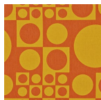
001 Sun Yellow/Orange

Complete product information at maharam.com 800.645.3943