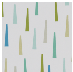
001 Emerald Light and Turquoise

Complete product information at maharam.com 800.645.3943