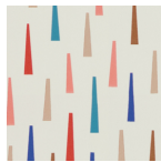
002 Citrus and Ultramarine