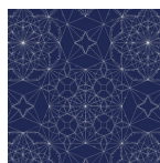
002 Midnight Blue