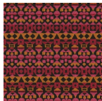
003 Crimson and Pink