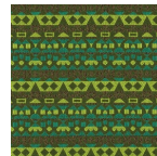
006 Green and Gold