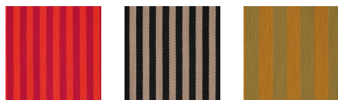
001 Orange Dark/Crimson 002 Black/Raw Umber 003 Ochre Dark/Sienna

Complete product information at maharam.com 800.645.3943